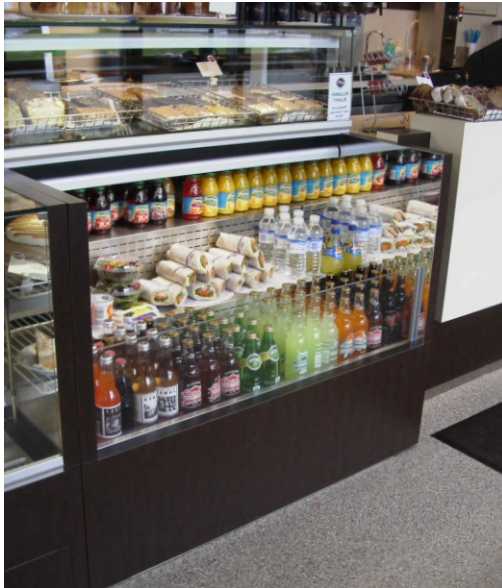
SQSRD 5448 DUAL CASE W/DRY SERVICE DISPLAY Refrigerated Service Top Display available - Model SQSRR